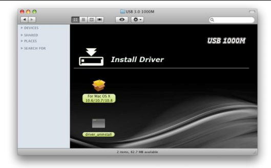
*Note: Actual image may vary

Follow the instructions on screen to install the driver. After driver installation is complete, you must restart your computer.